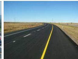
Trans Canada Rehabilitation