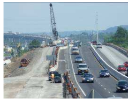
Metropolitan Freeway Widening