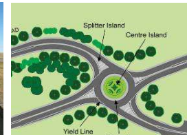
Provincial Highway Roundabout