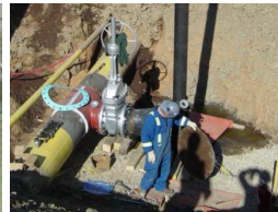
NOVA Firewater System Replacement