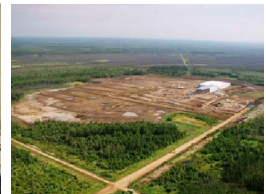
Site Selection for new Oriented Strand Board Facility