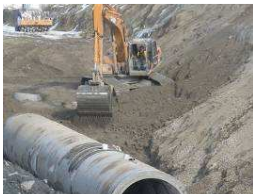
Stormwater Management Plan for Industrial Park