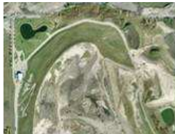
Landfill Cell Coverage and Drainage Improvements