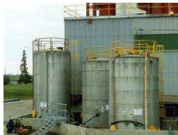
Insulation Plant Engineering Services