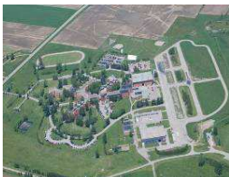
Phase I and II Environmental Site Assessments