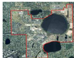
Delineation of Petroleum Hydrocarbon Spills