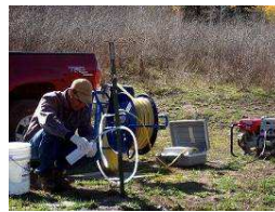
Groundwater and Soil Sampling