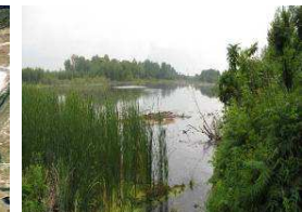
Groundwater and Soil Remediation Programs