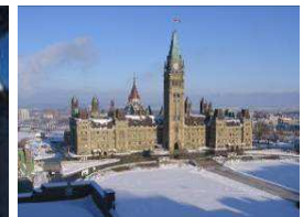
South Façade Restoration, Parliament Hill