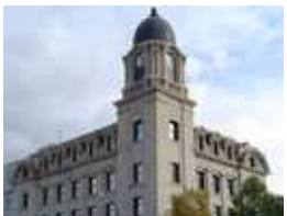
Building Envelope Review for Designated Heritage Building