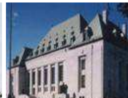
Sensitive Upgrade of Historic Roof and Wall Assemblies