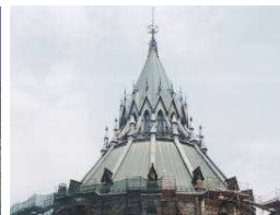
Environmental Monitoring / Building Envelope Performance